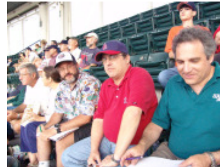
SABR members at Progressive Field during SABR 38

About 20 to 25 percent of the SABR membership participates in a research committee.