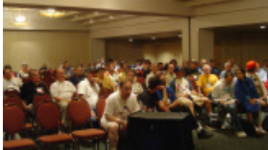
Dozens of members vie for the crown of Trivia champion at the annual SABR convention.

The SABR Annual Meeting is the place for members to get together and share their love of the game. It is truly an experience that makes you want to come back year after year.