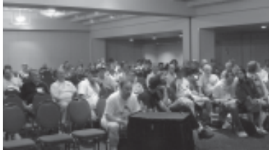
Dozens of members vie for the crown of Trivia champion at the annual SABR convention.

The SABR Annual Meeting is the place for members to get together and share their love of the game. It is truly an experience that makes you want to come back year after year.